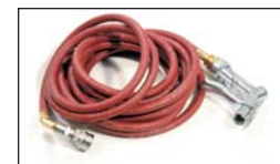
12' Produce Hose Assembly